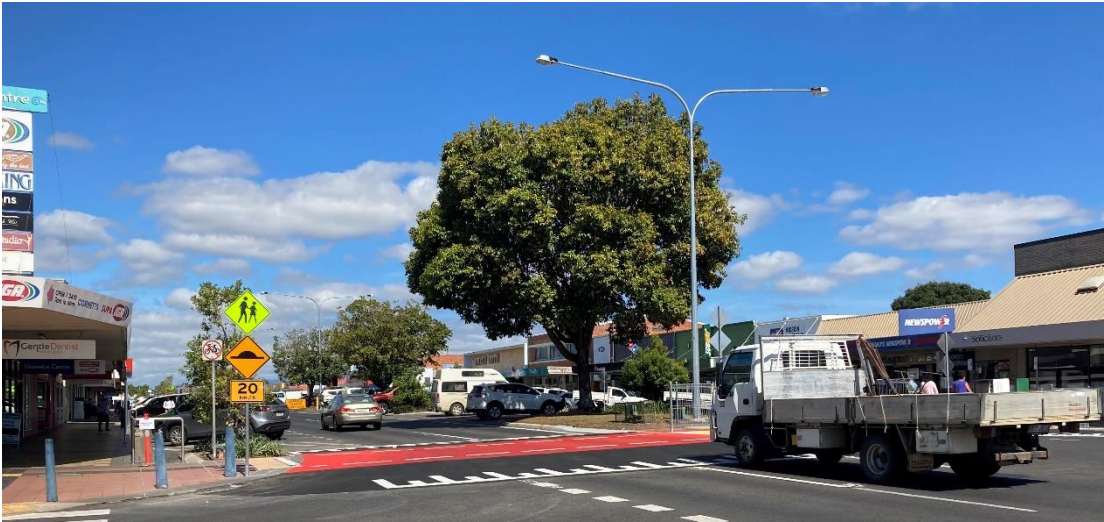
Raised pedestrian facility on Byrnes Street in Mareeba.

The program of road safety upgrades is jointly funded by the Australian and Queensland governments and works have been carried out at several locations across Far North Queensland.