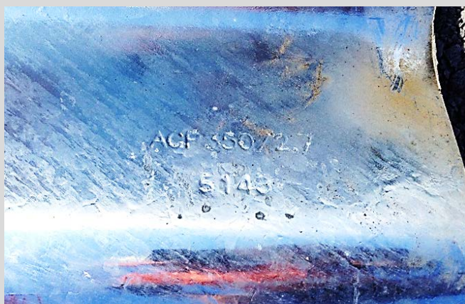
Typical view of the hard stamped details on the guardrail panel

Materials test certificates shall comply with the requirements of Clause 20.4.5.