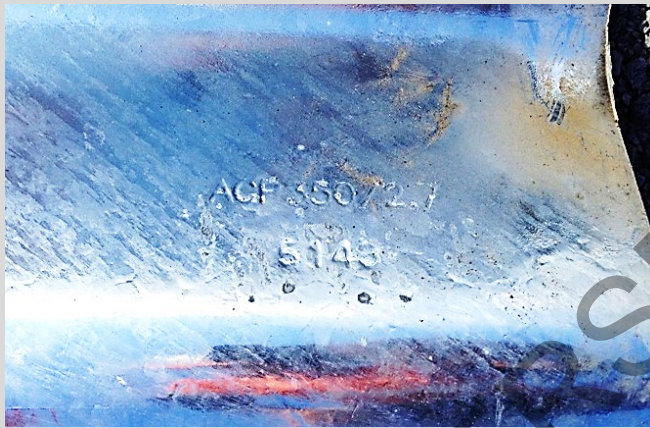
Typical view of the hard stamped details on the guardrail panel

Materials test certificates shall comply with the requirements of Clause 20.4.5.