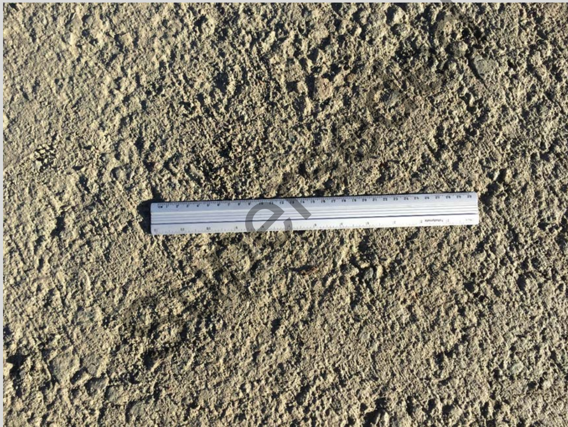
Figure 8.2.8.2 – Example of acceptable hard-cut surface

Unless the overlying layer is being constructed in the same work shift, a cement slurry (refer Clause 6.4) shall be applied to the hard-cut surface prior to placing the next heavily bound pavement layer.