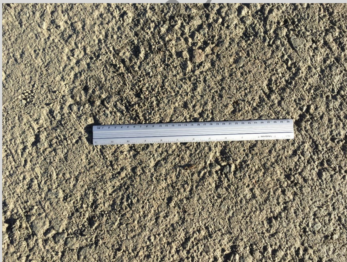
Figure 8.2.7.2 – Example of acceptable hard-cut surface

Where the construction process does not allow the heavily bound pavement layer to be hard-cut within the same work shift as the material was placed, the Administrator may approve the Contractor to delay the hard-cut process provided the Contractor can demonstrate that their nominated process will achieve an acceptable surface. The longer a heavily bound material is left prior to hard-cut, the more effort will be needed to hard-cut the surface and the more chance there is of damaging the pavement if inappropriate equipment is chosen (for example, using a grader with straight blade to hard-cut cured heavily bound pavement).