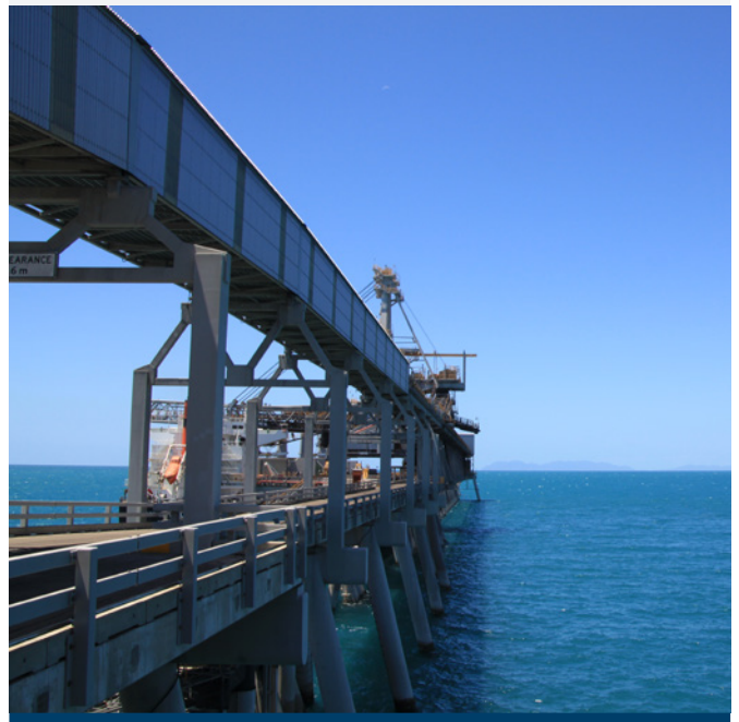
Port of Abbot Point.

TMR thanks the community and stakeholders for the valuable input into master planning for the priority Port of Abbot Point provided during public consultation. TMR also acknowledges the strong interest in the sustainable development of the port and the long-term protection of the Great Barrier Reef World Heritage Area and the Caley Valley Wetlands.