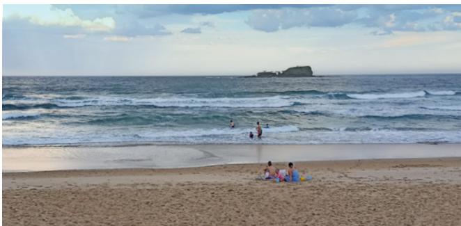
North Harbour Beach, Mackay.

The objective of changes will be to ensure the master plan and port overlay achieves the balance of sustainable port development and the protection of environmental and social values in the master planned area.