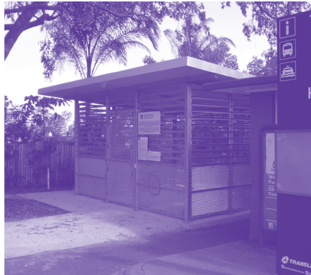
Figure 2: Providing a range of efficient and safe parking facilities will attract users.