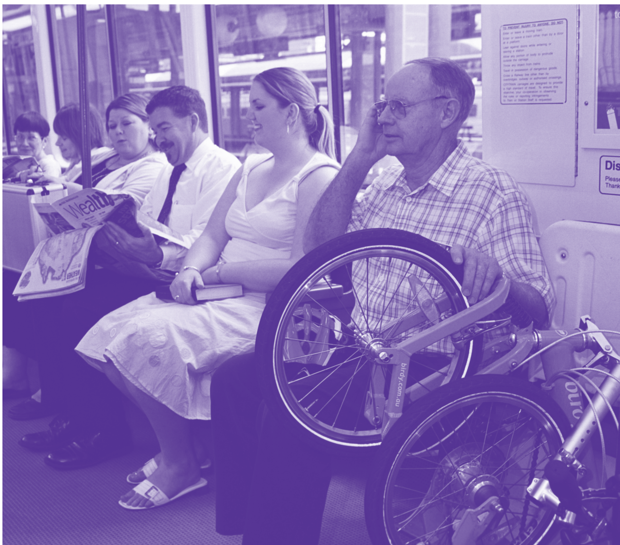
Figure 3: Folding bicycles need take up no more room than conventional luggage

Queensland Rail has a policy for the carriage of bikes on long distance (Traveltrain) and suburban (Citytrain) rail services in Queensland. Details can be found at www.citytrain.com.au (under the heading Plan your Trip ), or by phoning (07) 3235 2222 (Citytrain) or 132235 (Traveltrain).