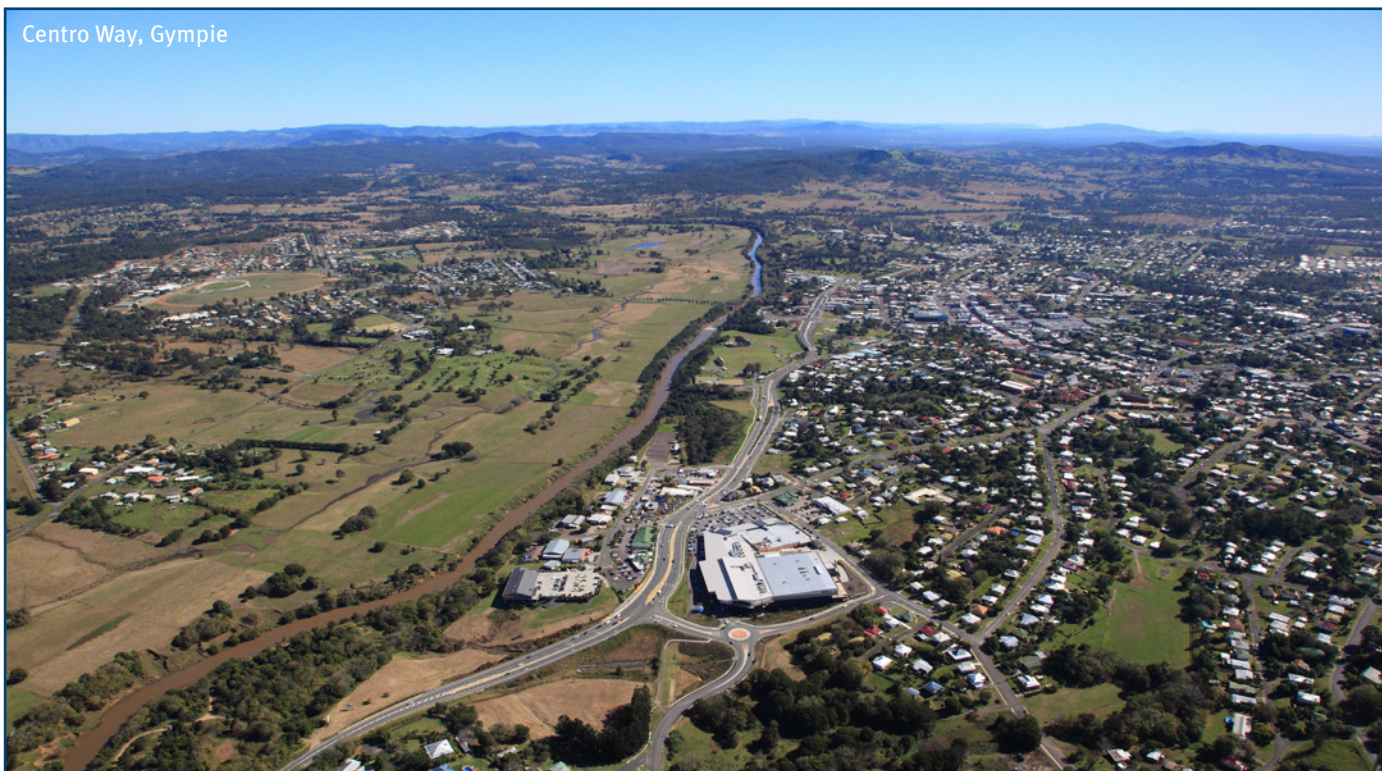
Centro Way, Gympie