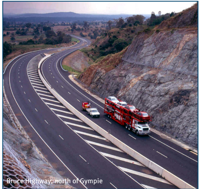
Bruce Highway, north of Gympie

State road projects in and around the Wide Bay/Burnett Region are funded by the Queensland Government and the Federal Government. In the current roads program, the Queensland Government is investing over $115 million in the region (including over $5 million in Transport Infrastructure Development Scheme projects), and the Federal Government is contributing around $381 million. Developers also contribute to the roads program.