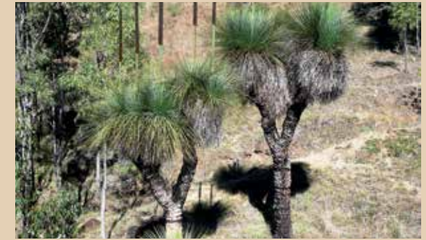
Grass trees between Linville and Benarkin