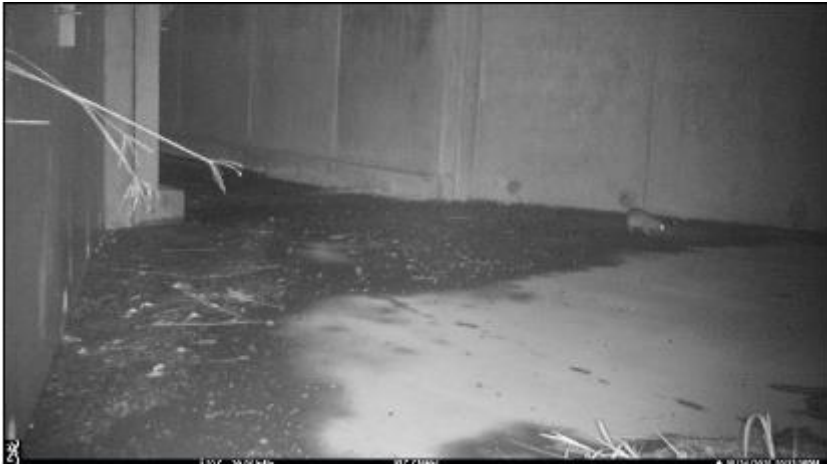
Figure 13: Bandicoot using Project fauna underpass