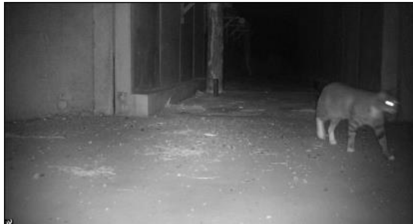
Figure 14: Feral cat using Project fauna underpass