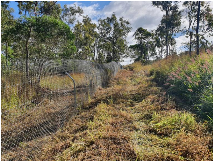
Figure 3: Fauna exclusion fence post maintenance, nth alignment