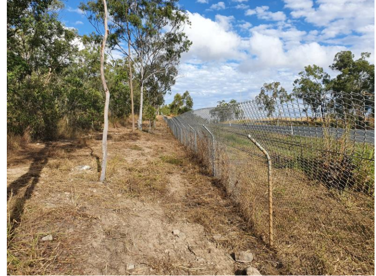
Figure 2: Fauna exclusion fence post maintenance, sth alignment