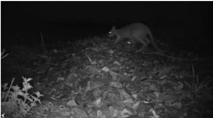
Figure 13: Wallaby and joey using Project fauna underpass