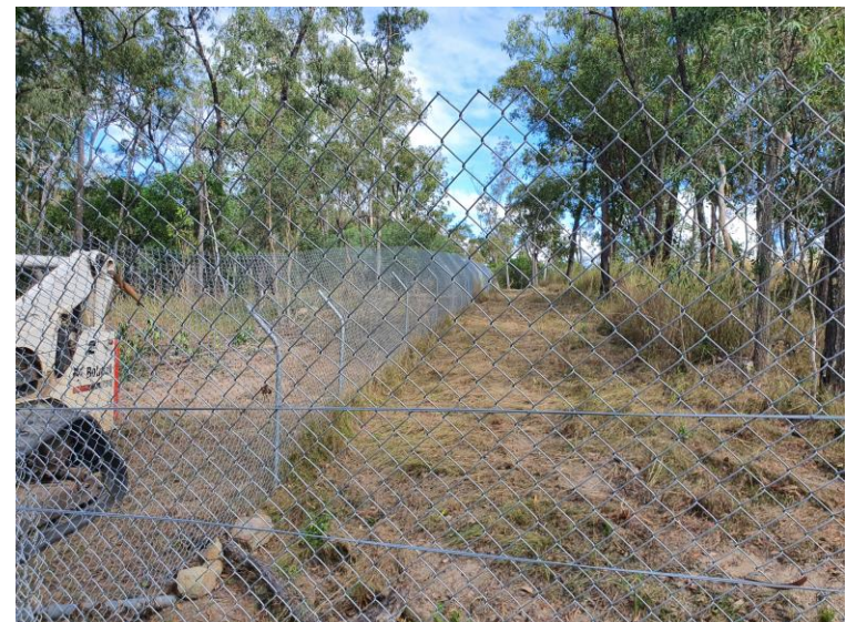
Figure 4: Fauna exclusion fence post maintenance, sth alignment