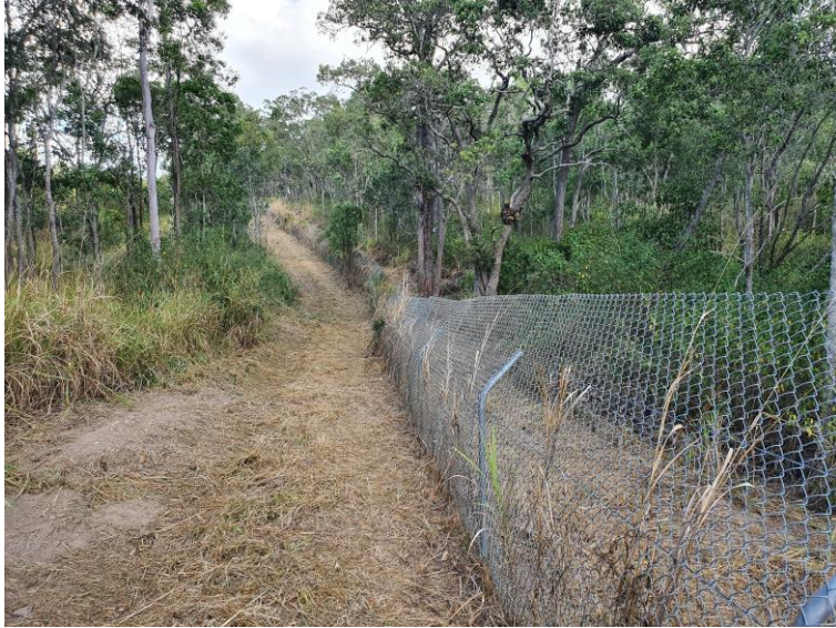
Figure 1: Fauna exclusion fence post maintenance, nth alignment