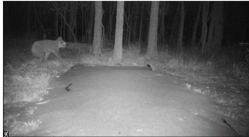
Figure 15: Koala traversing Project fauna fenceline