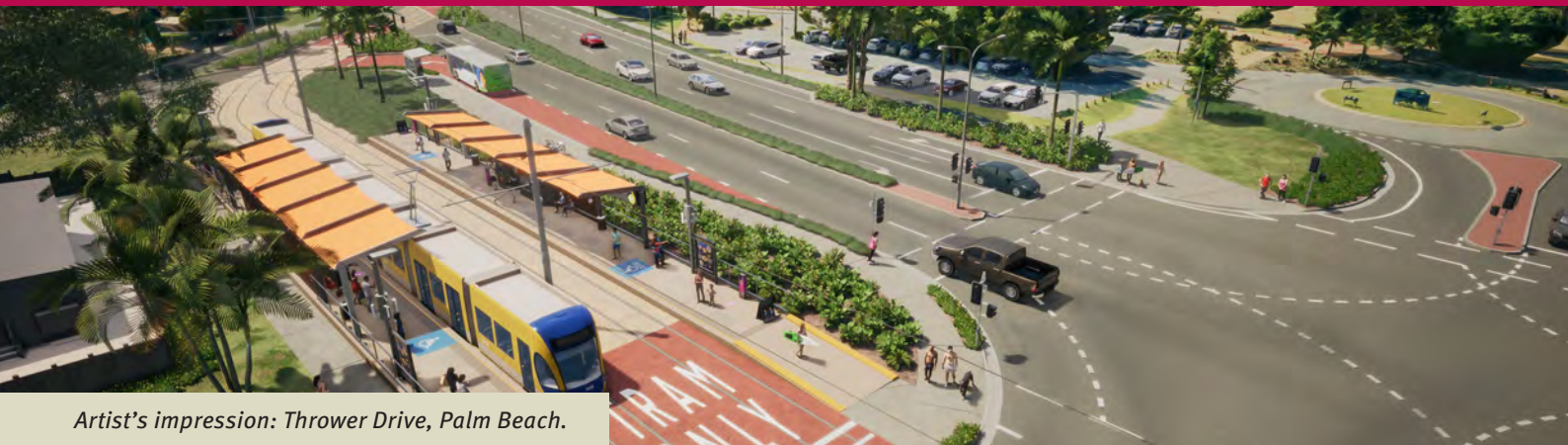
Artist's impression: Throrer Drive, Palm Beach.