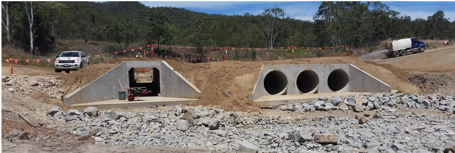
Plate 8: Construction of the fauna underpass (left in picture) is ongoing