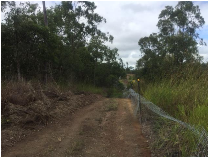
Plate 5: Temporary exclusion fencing erected to divert koala and joey into retained vegetation, 30/04/16