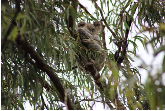
Plate 3: Koala and joey identified during pre-clearing surveys, 30/04/16