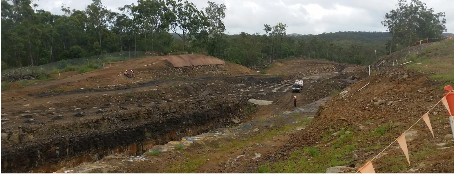
Plate 1: Ch 50.82km where significant excavation and blasting has been required to achieve finish grade, 10/02/17