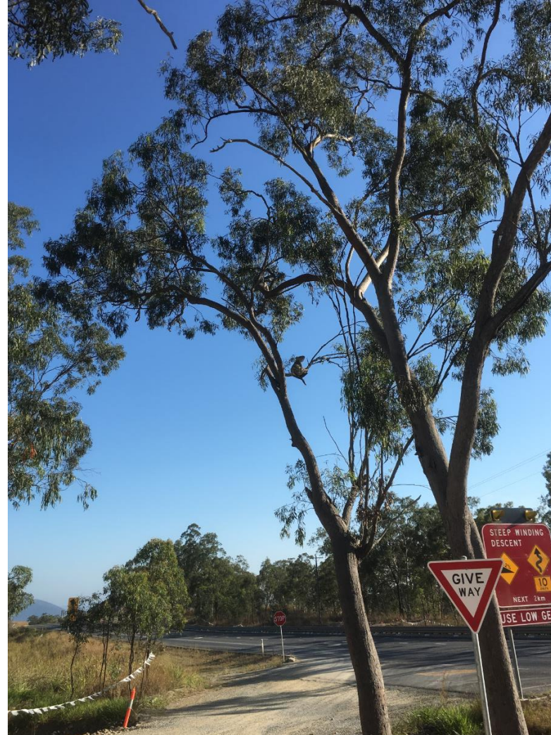
Plate 4: One of many koala sightings within the project extent during construction. Note the closeness to the existing active Peak Downs Highway, 11/10/16