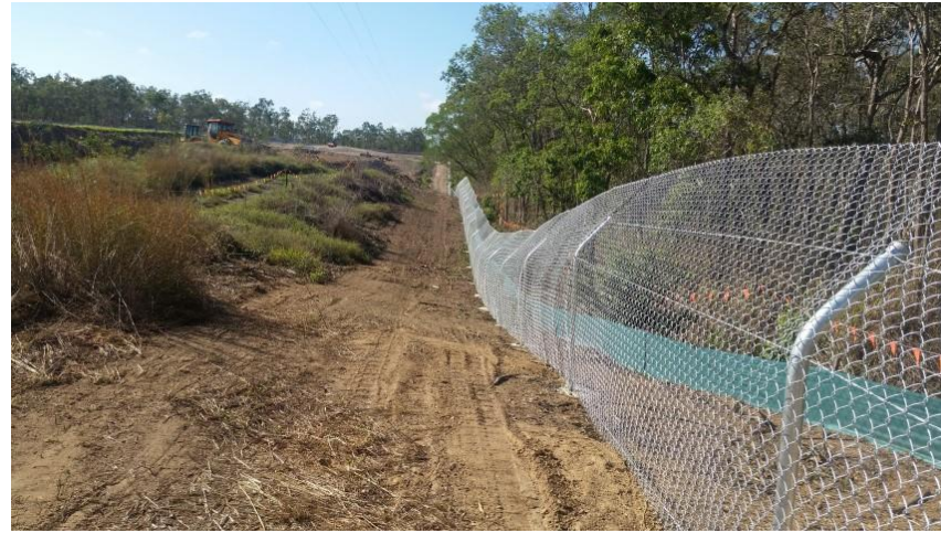
Plate 6: Erected fauna exclusion fencing, 23/11/16