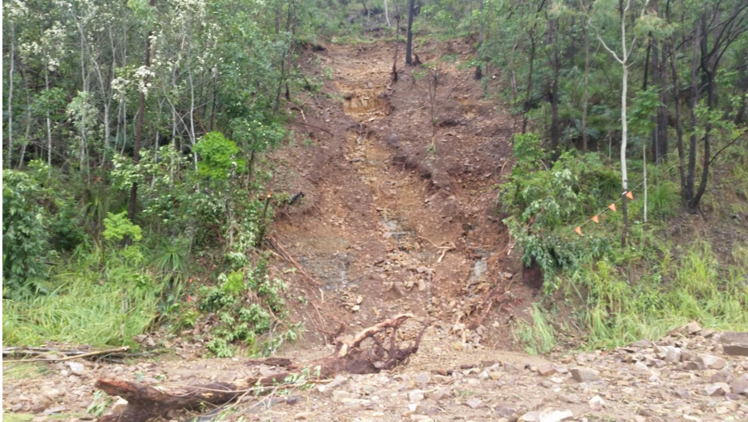
Plate 9: Slip uphill of the Eton Range as a result of Cyclone Debbie (31/03/17)