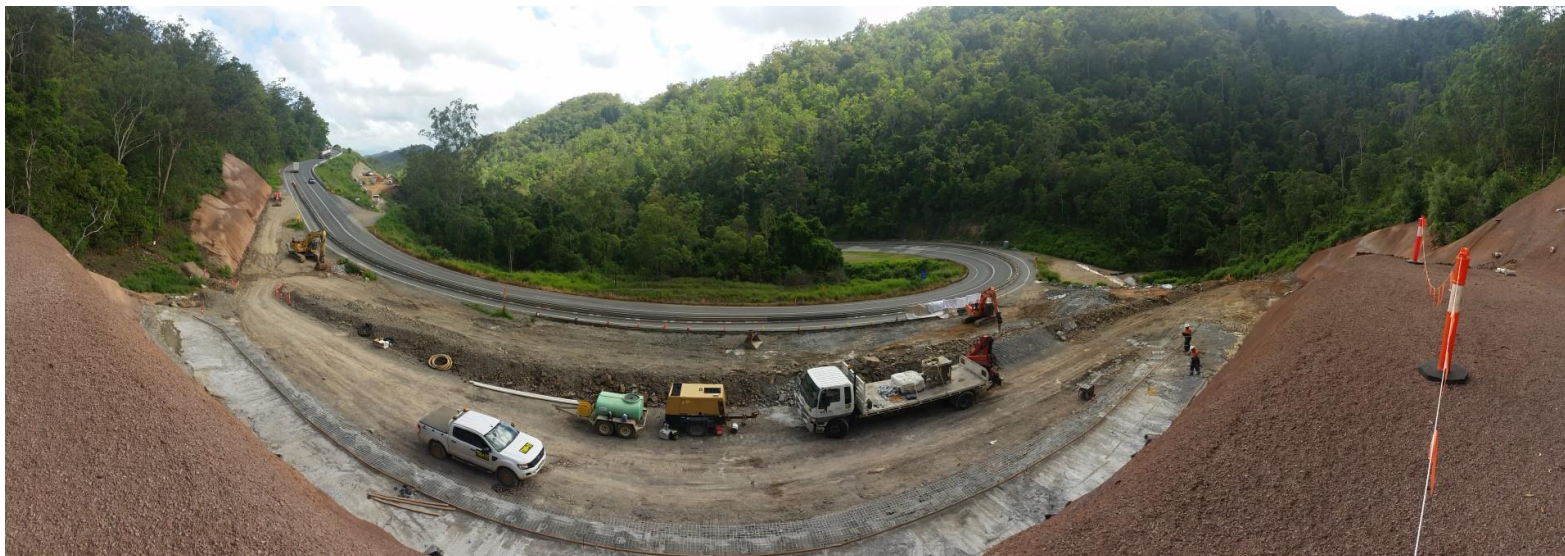
Plate 2: Eton Range lower hairpin embankment stabilisation, 03/02/17