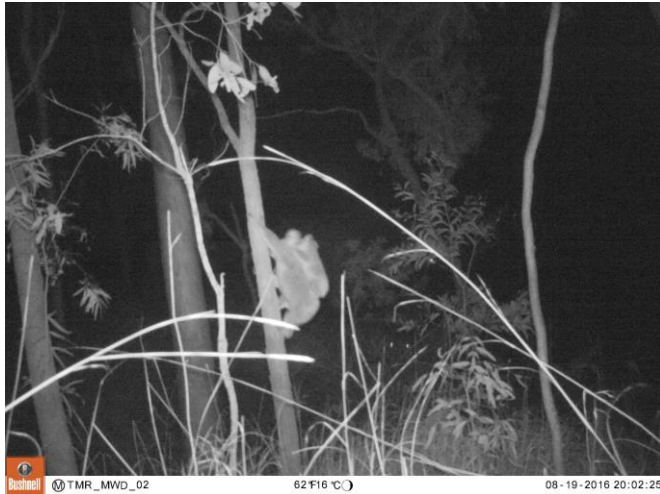
Plate 7: Koala and joey self-relocating to retained vegetation, 19/08/16