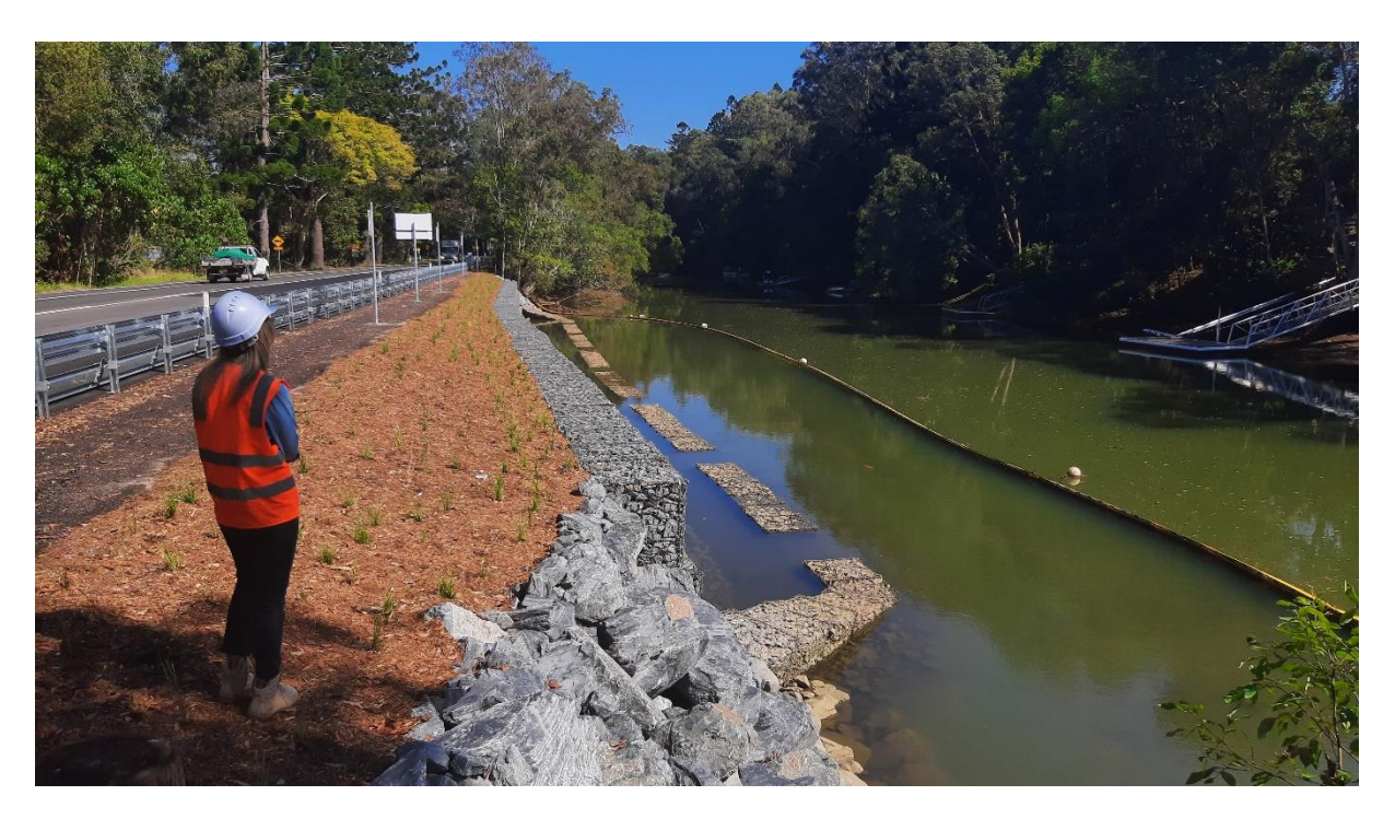
Picture 4 - Completed restoration works on Currumbin Creek Road Site 2