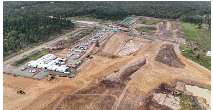
Aerial progress photo of the train manufacturing facility site – July 2024