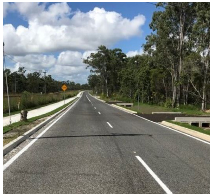
Completed Ritchie Road upgrade – Ritchie Road is the permanent access to the Torbanlea train manufacturing site for light vehicles.

Heavy vehicles access the site via the Bruce Highway.