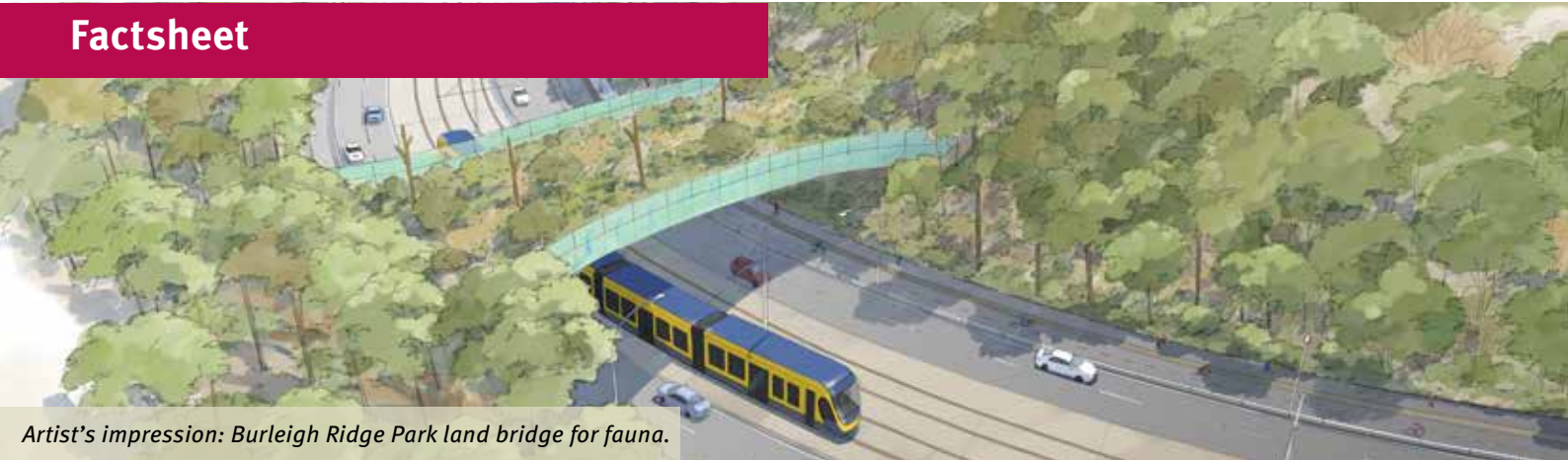
Artist's impression: Burleigh Ridge Park land bridge for fauna.

Gold Coast Light Rail Stage 4 will deliver a 13km extension south of the Gold Coast Light Rail Stage 3, linking Burleigh Heads to Coolangatta, via the Gold Coast Airport. The Queensland Government has committed $1.5 million to undertake the Gold Coast Highway (Tugun to Coolangatta) Multi-modal Corridor Study . A further $5 million jointly funded by the Queensland Government and City of Gold Coast has been committed to undertake a Preliminary Business Case for Gold Coast Light Rail Stage 4 from Burleigh Heads to Coolangatta, via the Gold Coast Airport.