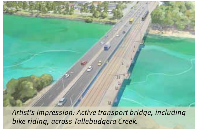
Artist's impression: Active transport bridge, including bike riding, across Tallebudgera Creek.

The project team will work closely with the Department of Environment and Science and Jellural Aboriginal Cultural Centre at Burleigh Heads to maintain this important cultural centre in its current location, and address car parking and ongoing access.