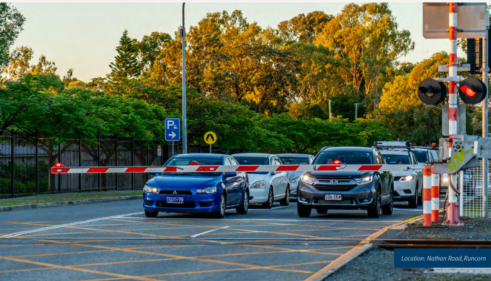
Location: Nathan Road, Runcorn

The project forms part of the Planning for Future Region-Shaping Infrastructure commitment led by the Queensland Government in partnership with the Australian Government and Council of Mayors (SEQ). The project will deliver a level crossing prioritisation framework – including prioritisation methodology, priority list of crossings and high level concept solutions for priority crossings for further investigation.