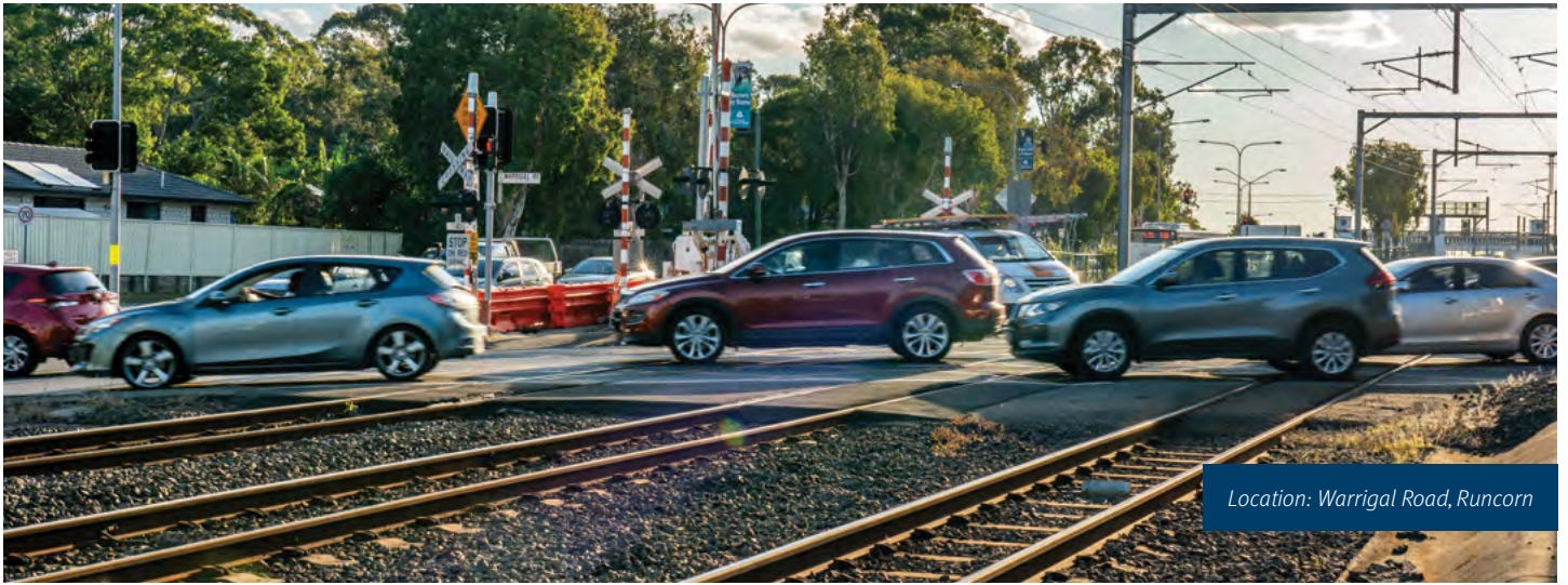
Location: Warrigal Road, Runcorn

Key indicators that may point to a high priority crossing: