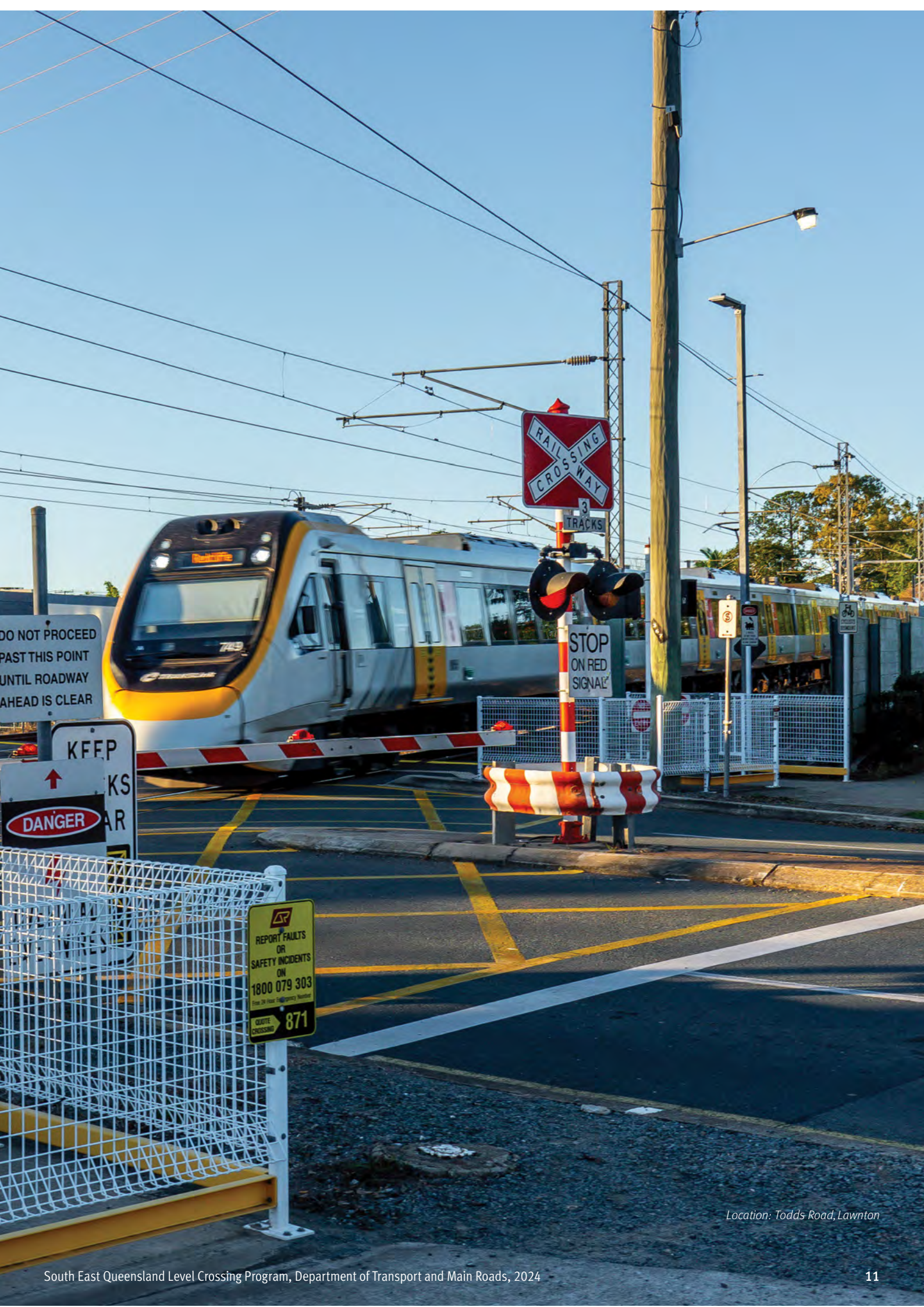
Location: Todds Road, Lawnton