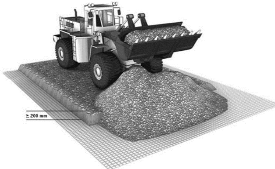
Figure 8.5 – Diagram illustrating granular or fill materials being placed on the geosynthetic in a manner which minimises damage to the geosynthetic