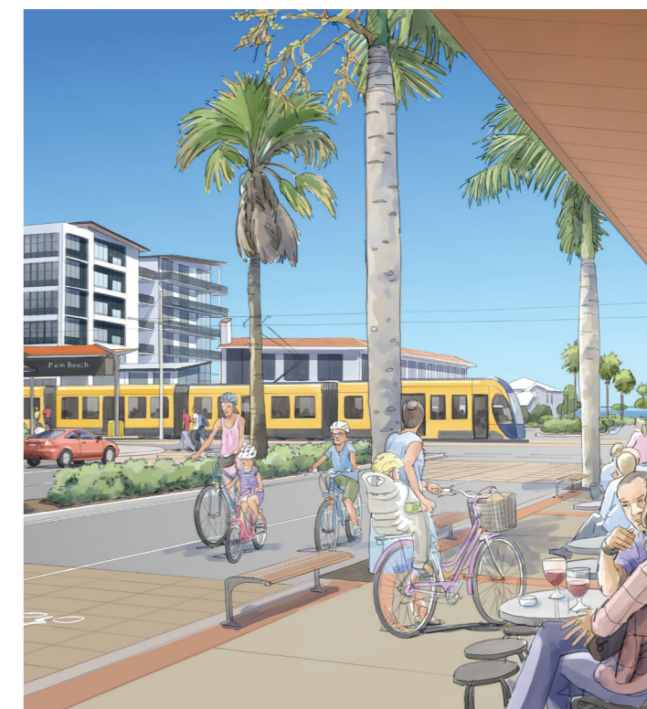
Artist impression: Palm Beach Avenue