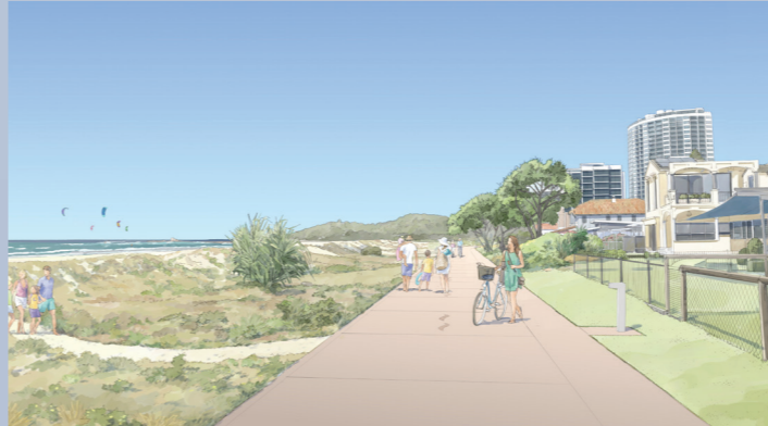
Artist impression: Oceanway at Palm Beach