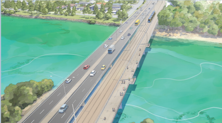
Artist impression: Active transport bridge, including bike riding, across Tallebudgera Creek