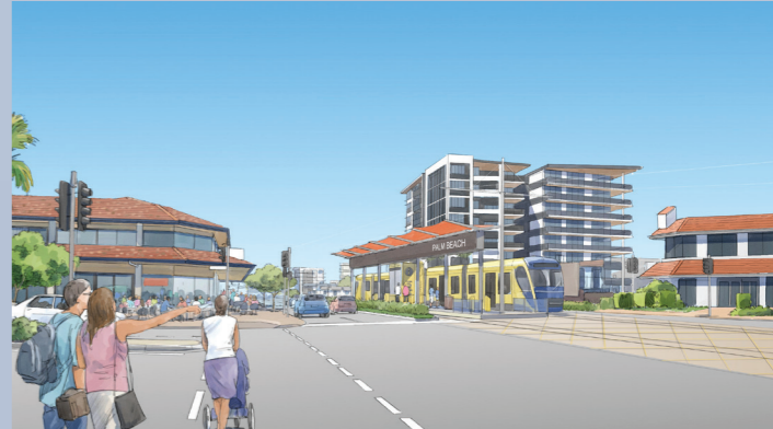
Artist impression: Gold Coast Highway future perspective