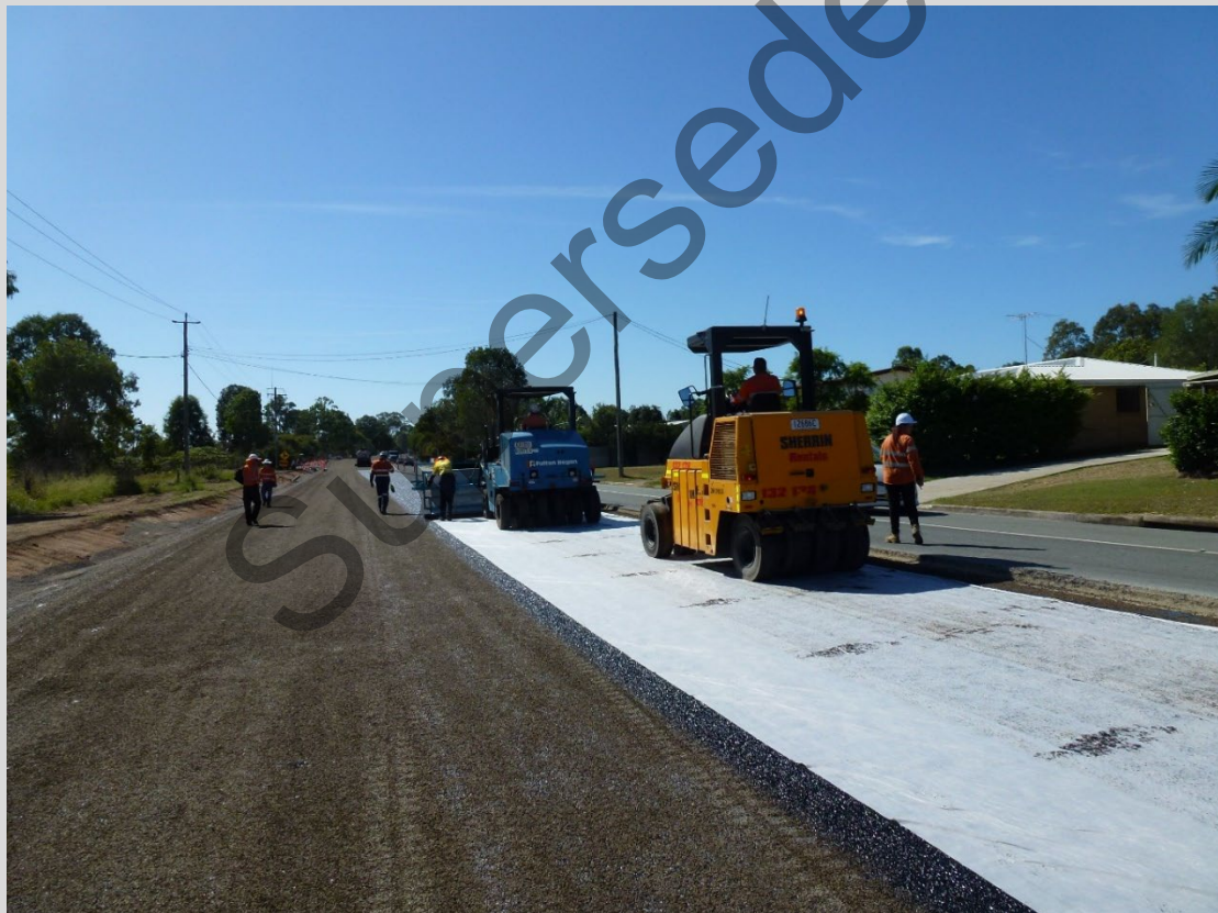
Figure 8.7.2 – Example of installation of geotextile using application frame attached to multi-tyred roller

Manual hand installation shall be carried out only in areas where it is impractical to use machinery.