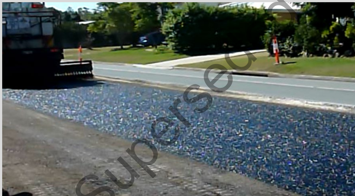
Figure 8.6.2 – Example of C170 bond coat sprayed on a prepared pavement surface

As a guide, the bitumen bond coated surface shall have a 'mirror' effect, which can be observed and assessed by the Administrator.