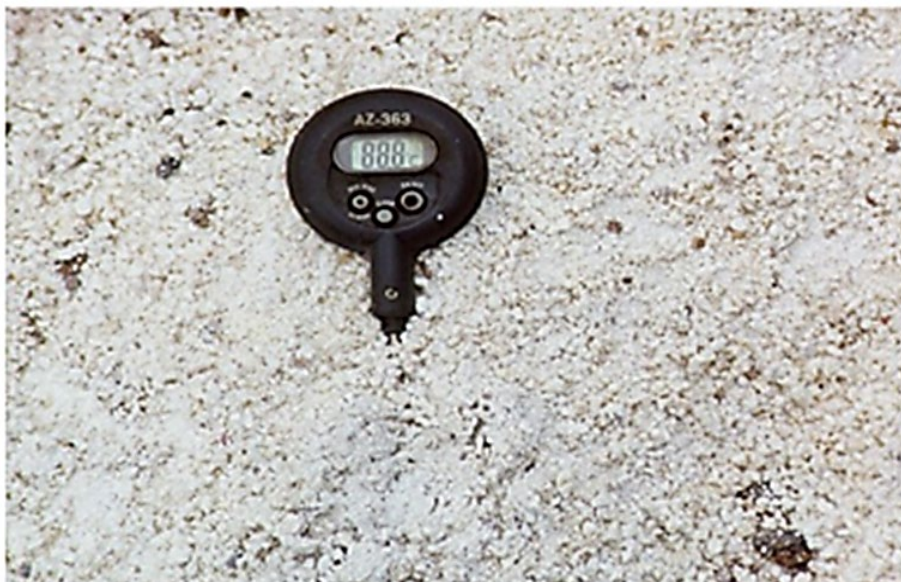
Figure 8.6.5.3 – Checking completion of slaking with temperature probe