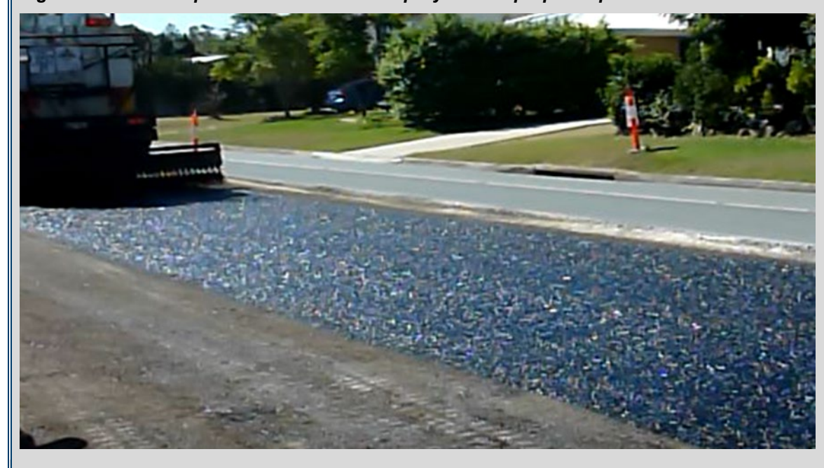
Figure 8.6.2 – Example of C170 bond coat sprayed on a prepared pavement surface

As a guide, the bitumen bond coated surface shall have a 'mirror' effect, which can be observed and assessed by the Administrator.