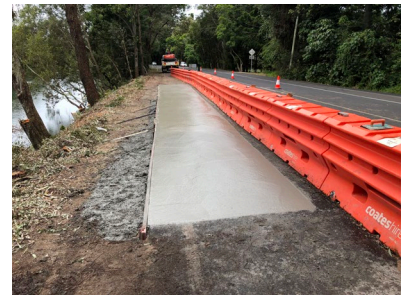
Currumbin Creek Road during emergency repairs