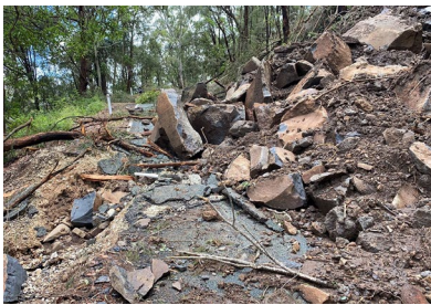
Tamborine Mountain Road landslip