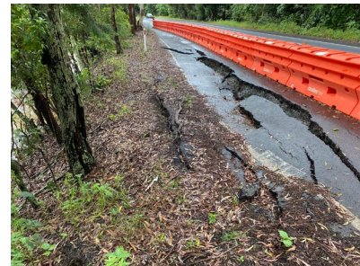
Currumbin Creek Road damage after the event