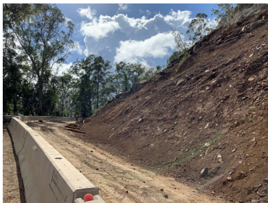
Tamborine Mountain Road during emergency repairs