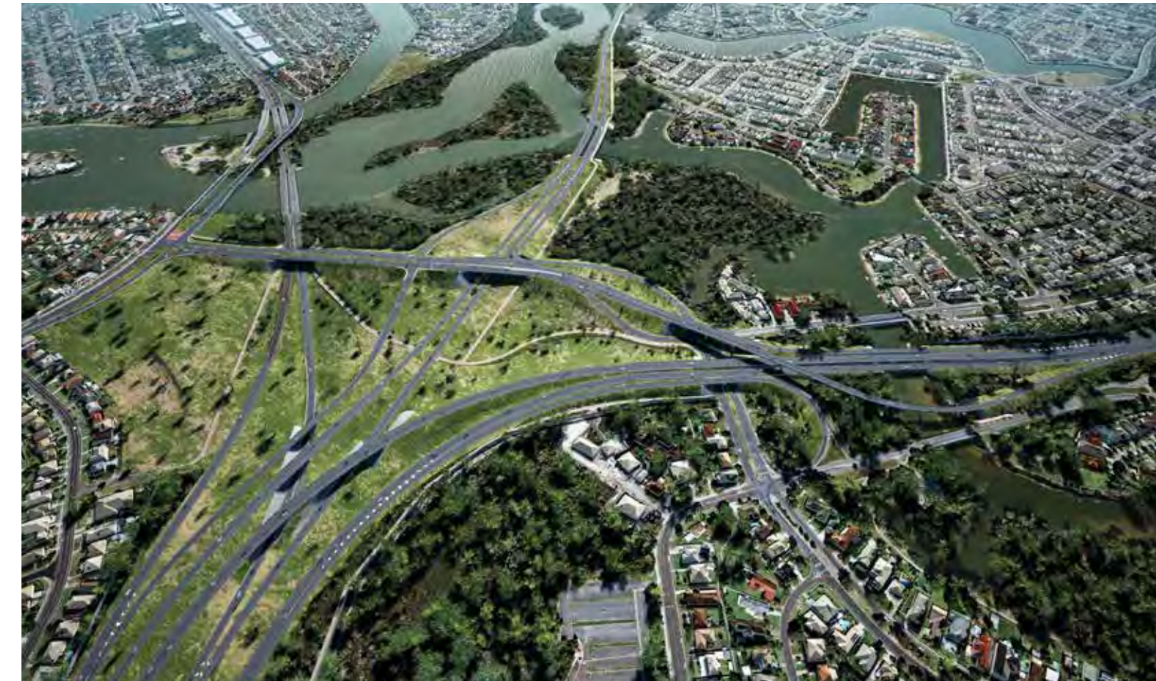
Artist's impression: Mooloolah River Interchange (Mooloolaba to the left)