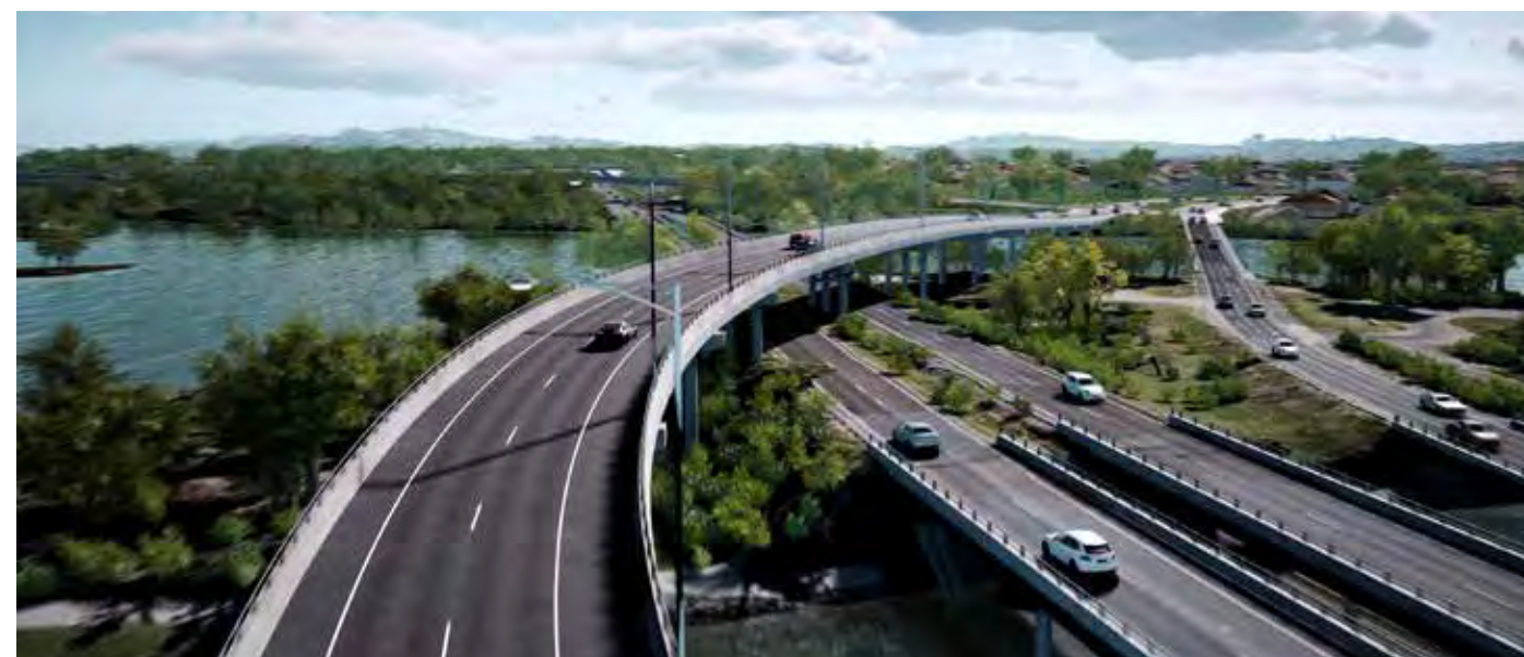
Artist's impression: New overpass connecting Nicklin Way northbound with Brisbane Road in Mooloolaba (Mooloolaba to the right)

*Free call from anywhere in Australia, call charges apply for mobile phones and payphones. Check with your service provider for call costs.