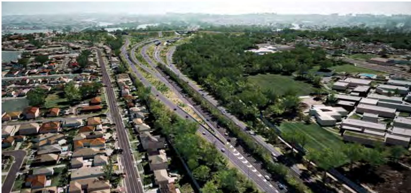
Artist's impression: Sunshine Motorway leading to the Mooloolah River Interchange (looking south towards Birtinya)