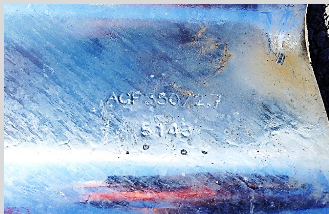
Typical view of the hard stamped details on the guardrail panel

Materials test certificates shall comply with the requirements of Clause 20.4.5.