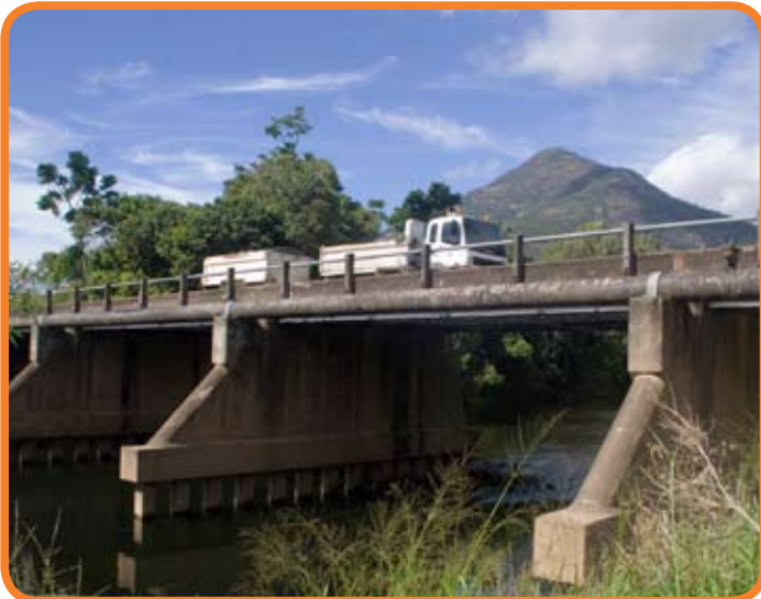
The current Mulgrave River Bridge - completion of the new bridge is expected Christmas 2009.

“As a local resident for many years, I have experienced first-hand the inconvenience of highway closures due to wet season flooding.