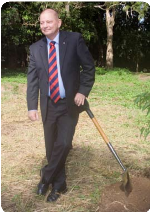
Minister Pitt at the official launch of the new Mulgrave River bridge.

CONSTRUCTION of the new $48 million Mulgrave River bridge at Gordonvale has begun with Minister for Main Roads Warren Pitt and the Federal Member for Leichhardt Jim Turnour officially launching the project on Thursday, 29 May 2008.