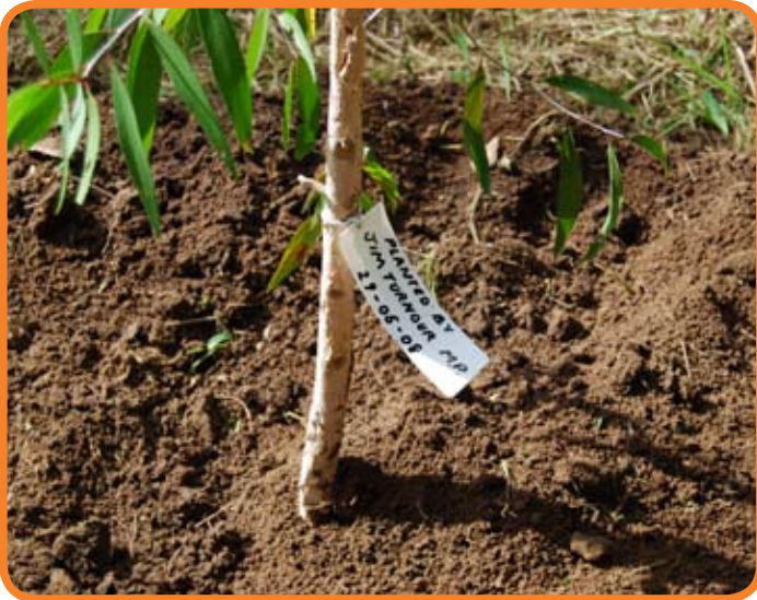
The first of the 5,000 native seedlings to be planted in and around the project.